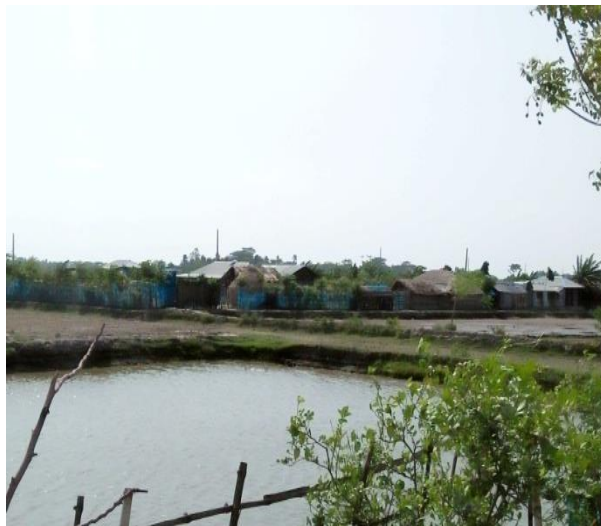
Photo 29: Group Relocation site: Meeting at CEIP Village, Uttar Kamarkhola under Polder-32