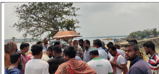
Photo 21: The LA committee created a working environment by meeting with those who had problems to embankment work from km 19.100 to 20.000 of Polder-43/2C.