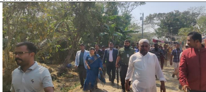
Photo 9: Field visited at alignment of embankment near Japani Barracks of Polder-39/2C with UNO, Bhandaria Upozila of Pirojpur district.