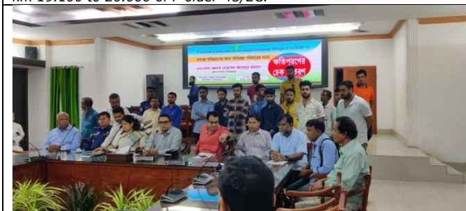
Photo 23: Mr. DC, Pirojpur distributed cheque to awardees of Polder-39/2C on 15.03.2023.