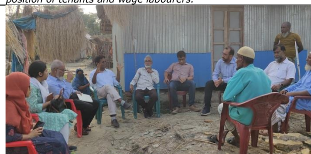
Photo 26: In presence of the WB team, meeting with awardees of Polder-48 near DS-2 on 30.05.2023.