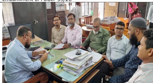
Photo 16: Meeting with LA branch of Pirojpur regarding to expedite the CUL payment of Polder-39/2C.