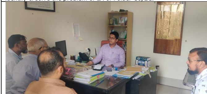
Photo 19: The LA Committee is requests the LAO of Pirojpur to expedite the payments for the acquired land of Polder-39/2C.