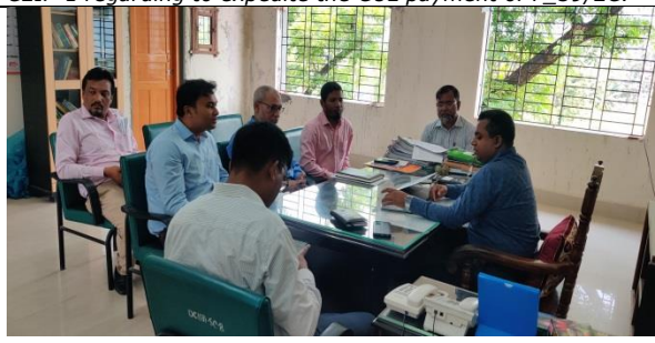
Photo 4: Meeting with ADC, Patuakhali regarding LA issues and payment of CUL of Polder-43/2C, 47/2 & 48.