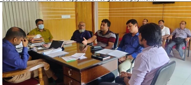
Photo 5: Meeting with ADC & LAO, Jhalakathi in presence of WB Team & PMU officials regarding to expedite the CUL payment of Polder-39/2C (Jhalakathi District).