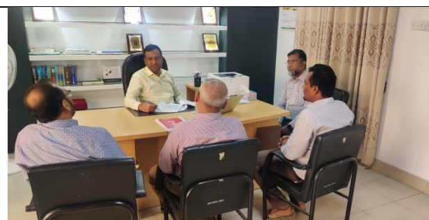
Photo 22: Meeting with the ADC about expediting the land acquisition of Polder-41/1& 40/2.