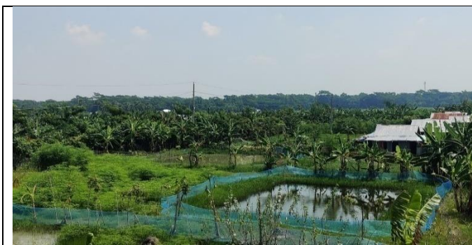
Photo 36: Group relocation site of Dhakin Charduani of Polder 40/2