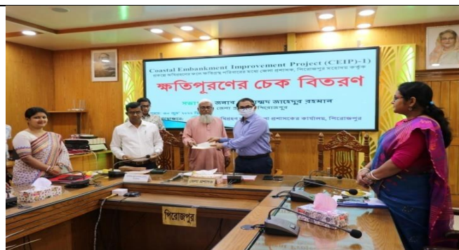
Photo 1: DC, Pirojpur distributed cheque to awardees of Polder-39/2C.