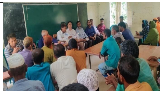
Photo 37: Meeting with relocated EPs at Dakhin Charduani of Polder-40/2.