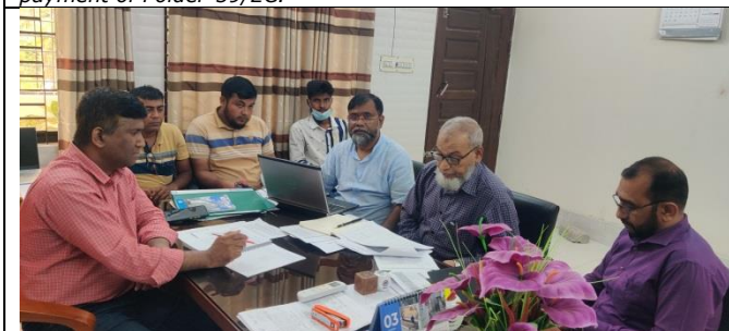
Photo 17: LA Committee meeting was held at Pirojpur XEN office to identify & solve the problem of LA of Polder-39/2C.