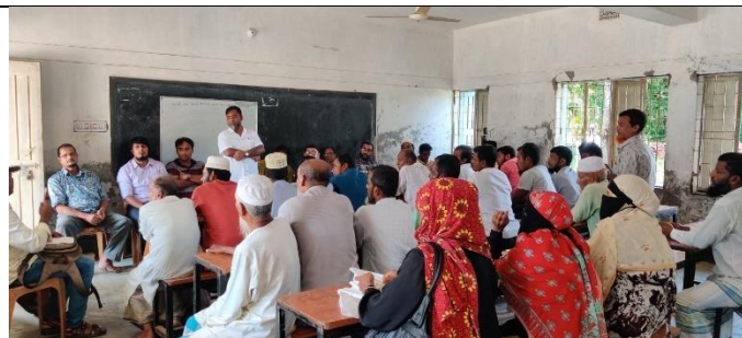
Photo 3: Meeting with awardees at Choto-Shewlamouza of Polder-39/2C for submission of application to get CUL payment.