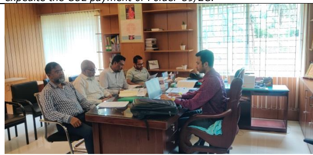
Photo 18: LA Committee meeting was held at Patuakhali XEN office to identify & solve the problem of LA of Polder-43/2C.