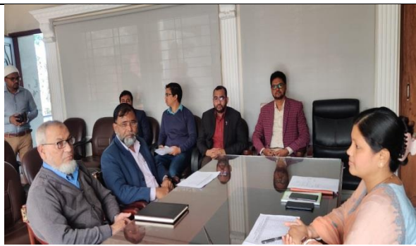
Photo 8: Meeting with UNO, Bhandaria Upazila under Pirojpur district regarding alignment problems of P_39/2C.