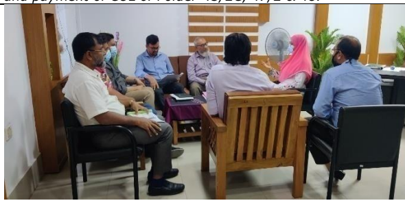
Photo 6: Meeting with ADC, Khulna in presence of WB & PMU officials regarding expedite the CUL payment of P_32 & 33.