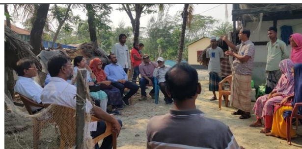
Photo 12: In presence of the WB team, meeting with awardees of Polder-48 near DS-6 on 30.05.2023.