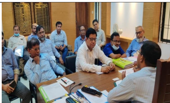
Photo 2: Meeting with ADC & LAO, Pirojpur in presence of PD, CEIP-1 regarding to expedite the CUL payment of P_39/2C.