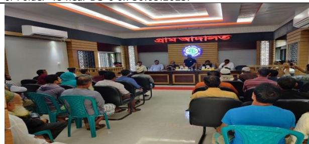
Photo 14: Meeting with Chairman of Telekhali UP regarding shifting the illegal structures from the alignment of Embankment of Polder-39/2C