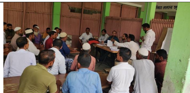
Photo 24: Meeting in Polder-43/2C by the committee for finalizing the list for spot verification considering the present position of tenants and wage labourers.