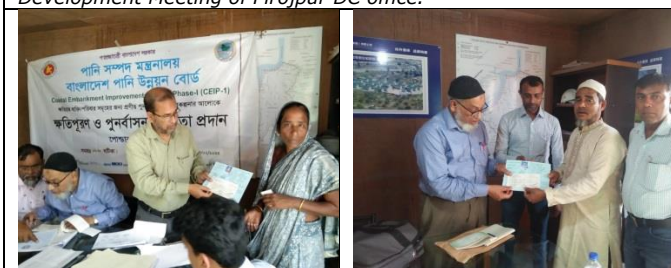
Photo 27: Compensation & Resettlement Assistance provided to squatter in Polder-39/2C through BWDB.