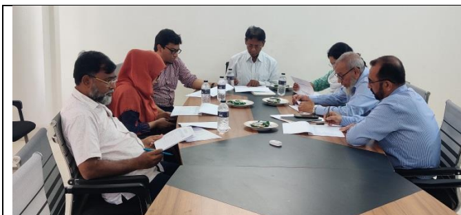
Photo 11: Meeting with Social Team of the World Bank (WB) Mission at CEIP-1 conference room, Patuakhali on 30.05.2023.