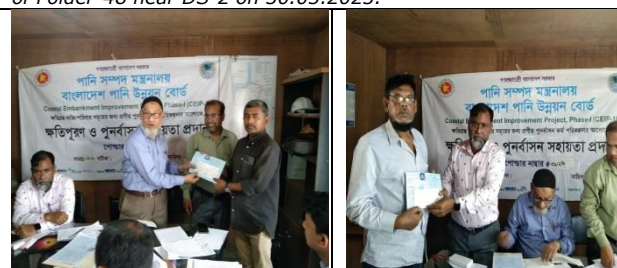
Photo 28: Compensation & Resettlement Assistance provided to squatter in Polder-39/2C through BWDB.