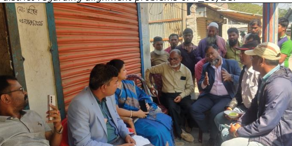
Photo 10: Meeting with UNO, Bhandaria of Pirojpur District at Monju bazar regarding alignment issues of Polder-39/2C