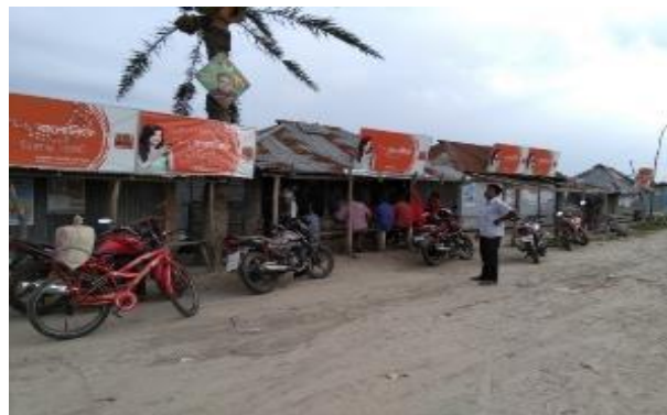
Photo 33: Relocation site at Mollikerber Madrasha Bazar in Polder-35/3