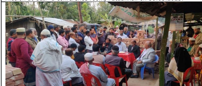
Photo 13: Meeting with UNO, Bhandaria of Pirojpur District at Monju bazar regarding alignment issues of Polder-39/2C