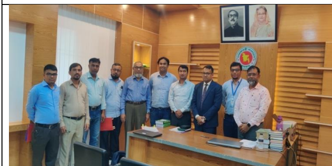
Photo 15: Meeting with ADC, Pirojpur regarding to expedite the CUL payment of Polder-39/2C.