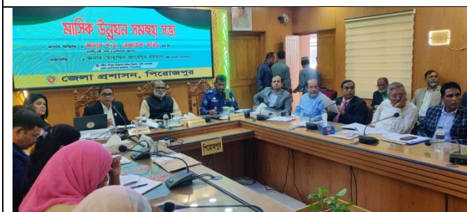
Photo 25: Presence of representative of CEIP-1 project in Monthly Development Meeting of Pirojpur DC office.