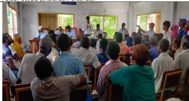
Photo 7: Consultation Meeting with titled landowner at Suterkhali UP of Polder-32 in presence of DC officials.